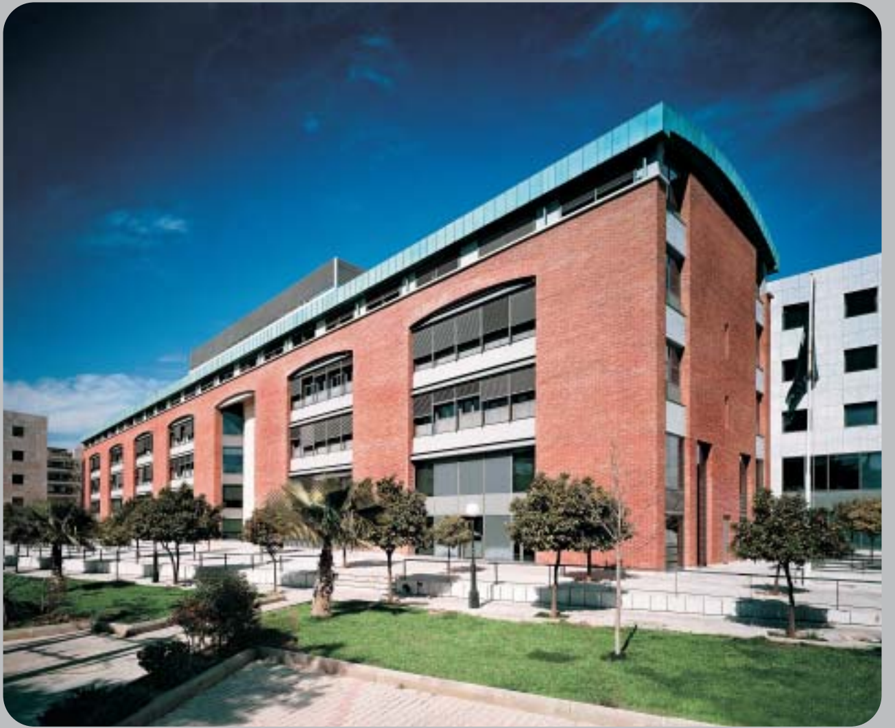
TOP Tankers new corporate headquarters in Athens